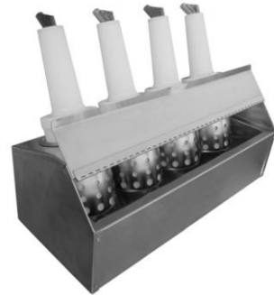
Model #: CC-LTC-4BR (Rear view, bottles not included)