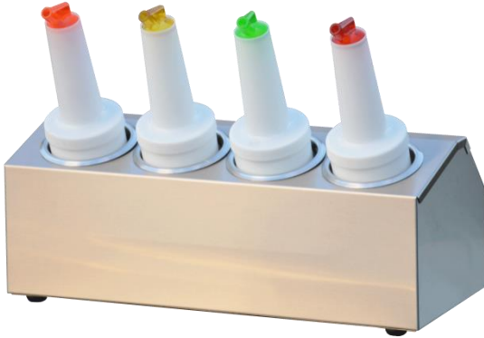
Model #: CC-LTC-4BR (Bottles not included)

See next page for a complete list of available models.