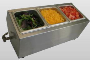
IUD-366BU Ice-Cooled Raised Rail