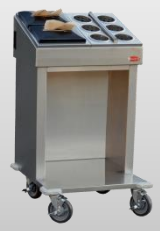
E1-CRT24-2V 24" E1 System Open Cart