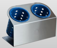
HKS-2 2-Hole Cantilevered Dispenser with RP-25 Series Cylinders