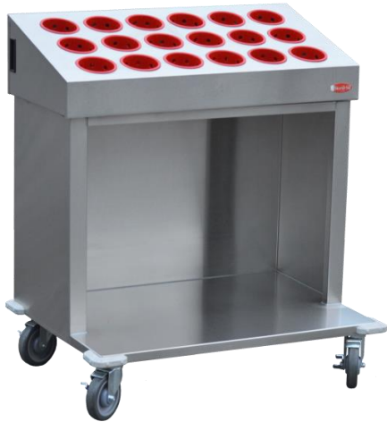
Model #: CRT36-18RP shown