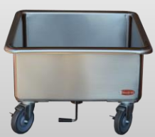
SK-2222 Heavy duty mobile soak sink