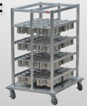
E1-BSC-16 E1 Basket Storage Rack with E1 Baskets