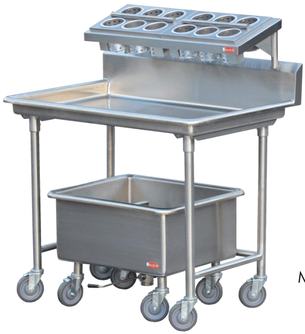
Model #: E1-LSS-W