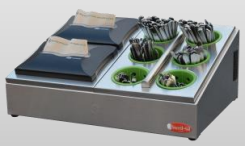
E1-CBD-2V E1 Countertop Dispenser with Accessories