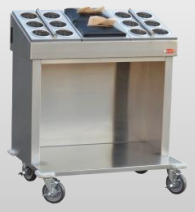
E1-CRT36-3V 36" E1 System Open Cart with Accessories

See the E1 System pages for additional dispensing options, accessories and details