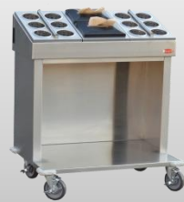
E1-CRT36-3V 36" E1 System Open Cart