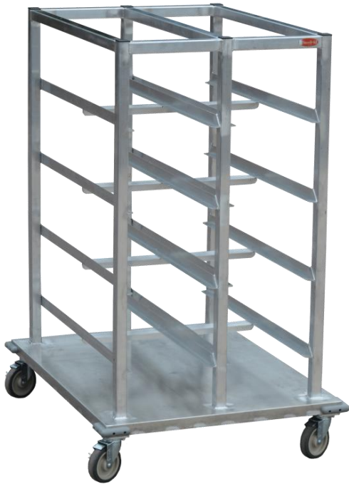
Model #: E1-BSC-16