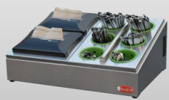
E1-CBD-2V E1 Countertop Dispenser