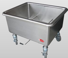
E1-SK-2 E1 System Basket Soak Sink