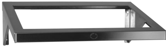
Model #: WSA-1HP (Holds one full-size hotel pan)