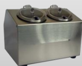
CC-LTC-2SW 2-Hole Insulated Condiment Dispenser