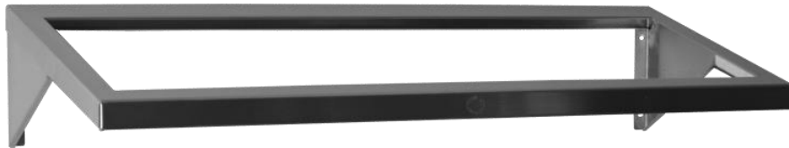
Model #: WSA-2HP (Holds two full-size hotel pans)