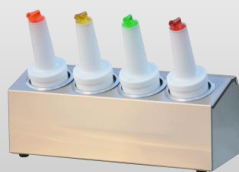
CC-LTC-4BR 4-hole Insulated Bottle Rail (bottles by other)