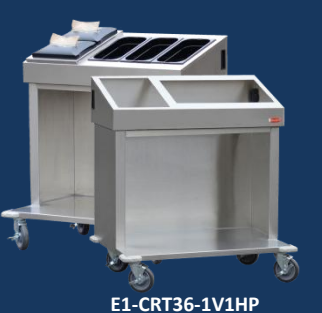
E1 System Inserts

The use of drop-in silverware baskets, dual napkin dispensers, napkin and straw dispensers, half-size hotel pan inserts or flat-top adapters makes E1 System carts the most configurable and adaptable carts available.