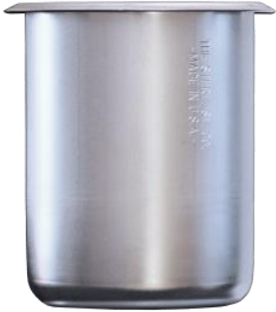
Model #: SC-750