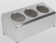
LTC-2 2-Hole Countertop Dispenser