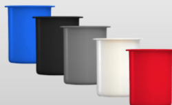
PC-700 Series Plastic 30 ounce containers