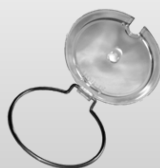
HC-20-X Hinged Cover for Steril-Sil 30 ounce Containers