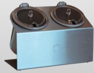
HKS-2 2-Hole cantilevered condiment dispenser