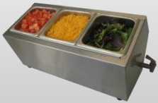
IUD-366-BU Ice-cooled dispenser for use with fountain jars or 1/6 size pans