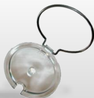
HC-20-X Clear hinged cover for 30 oz. containers