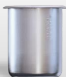
SC-750 30 oz. stainless-steel container