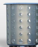
S-500 Stainless steel perforated cylinder

See the 30-ounce condiment accessories specification sheet for additional options and details